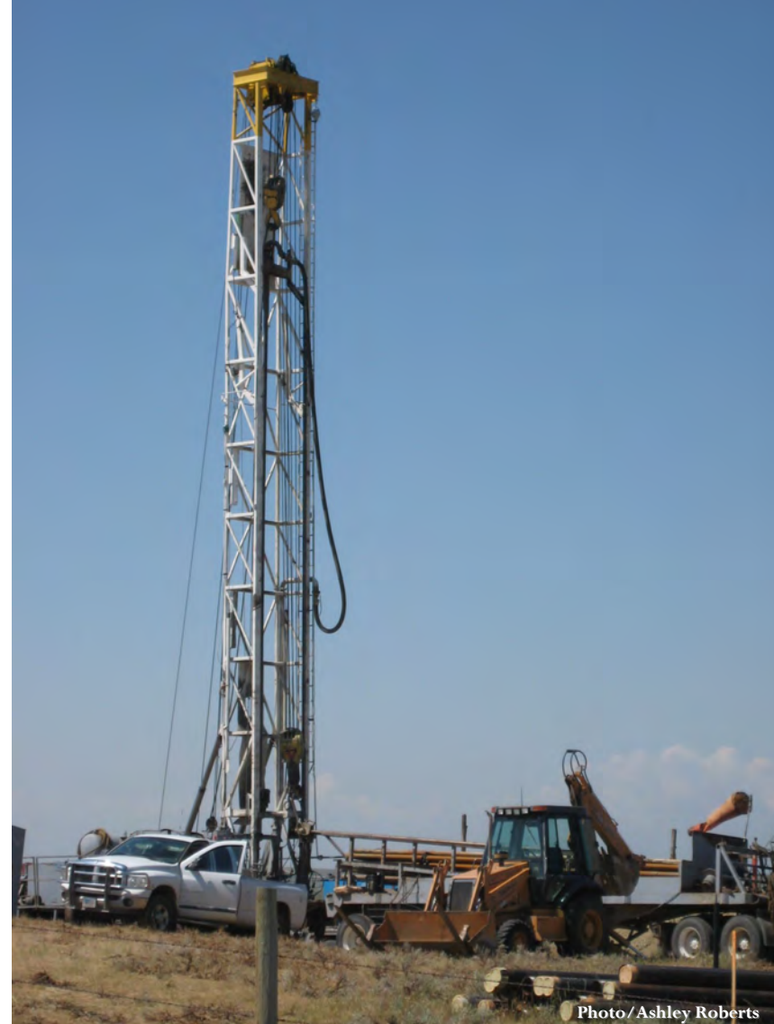
A coalbed methane drill rig operating in the Fortification Creek Area along the Fortification Creek Planning Area boundary.

Infrastructure including roads, well sites, and industrial traffic will forever alter the landscape and sense of remoteness. Overhead power lines damage scenic vistas and create raptor perches, increasing predation pressures on birds and small mammals. Erosion and vegetation change, particularly an influx of invasive species, are paramount concerns.