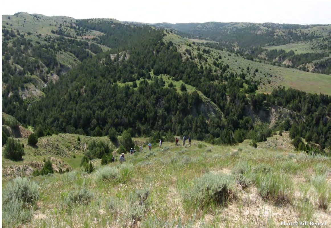
Hikers in Fortification Creek Area

This area is doubly rich, as it is also underlain with mineral resources including coal, oil, and natural gas. Notably, coalbed methane development has surrounded the area and in 2009 started to proceed within the area itself. Now, developers are eyeing the area's deep oil and gas formations. The Fortification Creek Area is an important contiguous habitat refuge in the increasingly industrializing landscape of the Powder River Basin.