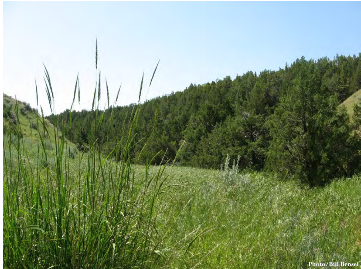
Bottomland forage and natural springs found in Fortification Creek Area are a vital resource in drier months for wildlife and cattle.

This area includes the Deer Creek, Barber Creek, Fortification Creek, and Bull Creek drainages which slope toward the Powder River incising deep canyons and steep draws.