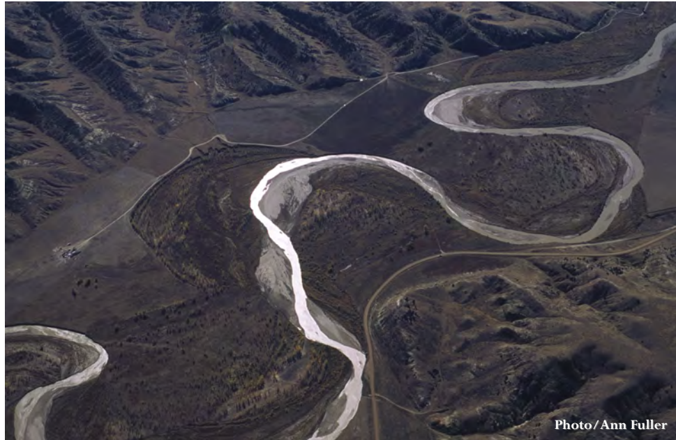
The Powder River meanders along the Western edge of the Fortification Creek Area

You have a say in how your public resources are managed.