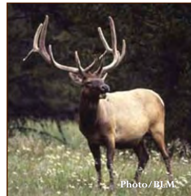
Bull elk in the Fortification Creek Area

Founders and members of the Resource Council have lived in the Fortification Creek Area since our group's inception. Our involvement in the area's protection has been stalwart since the beginning. Most recently, the Resource Council has been involved with the Fortification Creek Resource Management Plan Amendment which dictates how resources will be protected in the area. Our efforts have included tours and educational campaigns about the area and its resources, publications and alerts to our members and the community to engage the public in the process, and providing input to the Bureau of Land Management and state agencies during various stages of decision-making.