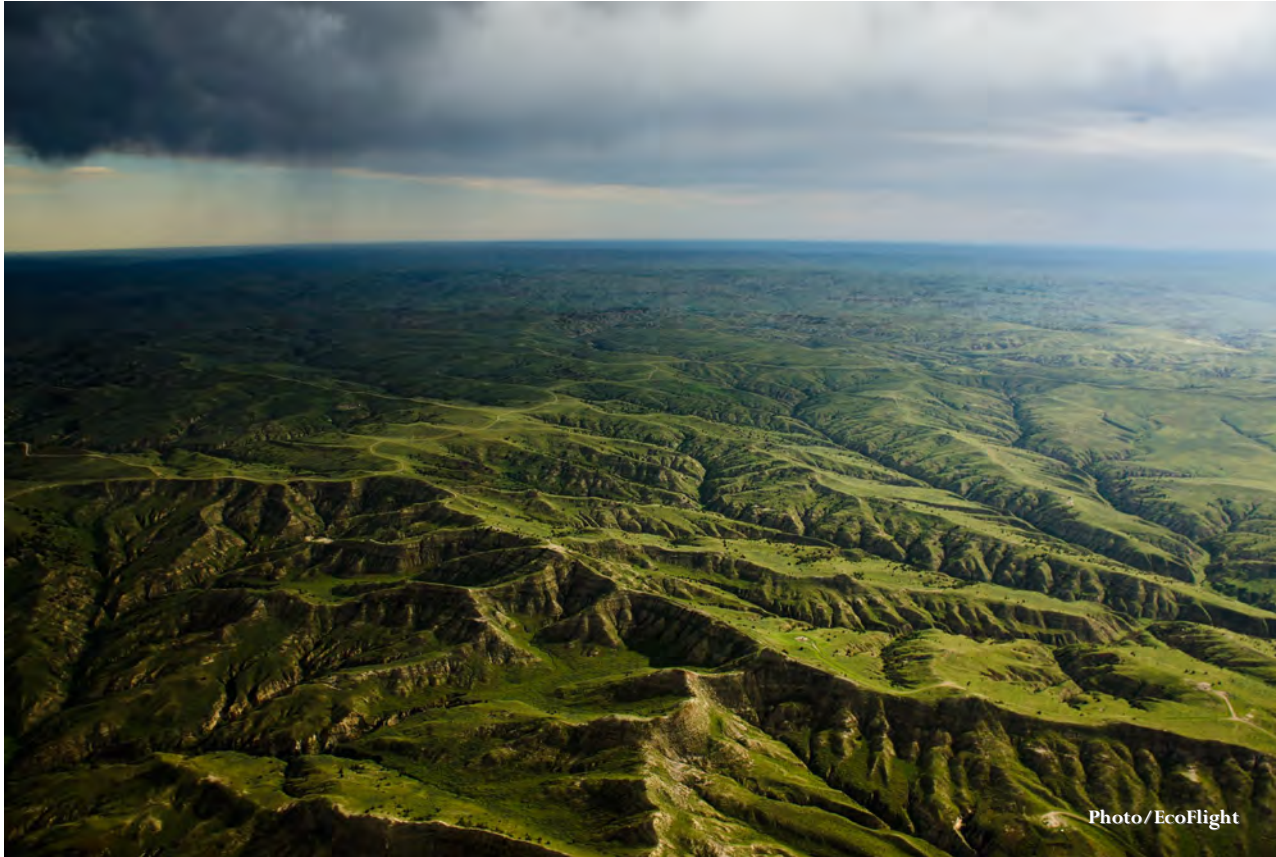
This aerial view shows the steep slopes and rugged beauty of the Fortification Creek Area.

Sagebrush and grasses shroud the ridges and hills while Rocky Mountain Juniper ( Juniperus scopulorum ) and Ponderosa Pine ( Pinus ponderosa ) crown slopes and crowd crevices across the landscape.