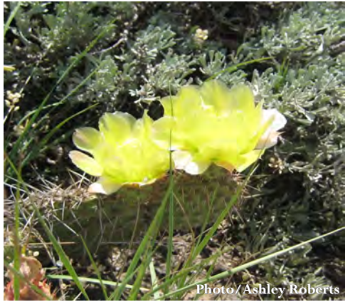
Blooming plains prickly pear cactus ( Cactaceae Opuntia ) in the Fortification Creek Area.