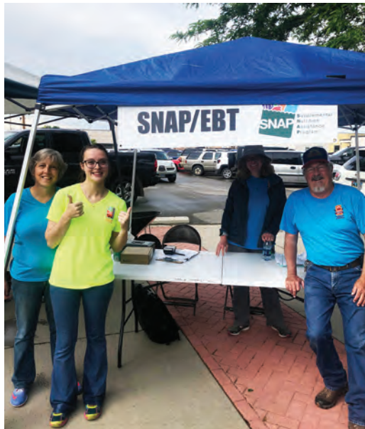
This year the Downtown Sheridan Farmers Market implemented SNAP in order to increase access to healthy, local food.

Furthermore, it was evident from the agency's announcement that the proposed rule was influenced by the media attention garnered by a Minnesota millionaire who gamed the system and signed up for SNAP. Once he received benefits, he went public and appeared on several news programs and talk shows, ginning people up about how