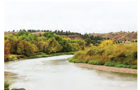
Powder River and several other area conservation organizations celebrated the first Wyoming Public Lands Day on Sept. 28 by cleaning up trails at the Welch Ranch BLM Special Recreation Management Area near Sheridan.