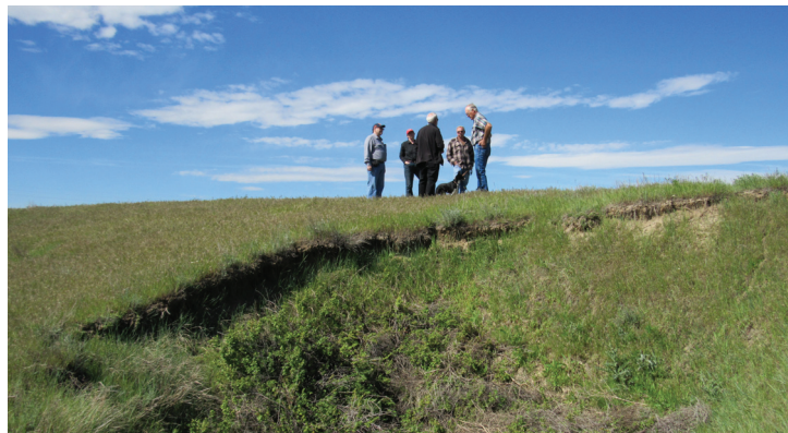
Tongue River Valley subsidence

“We want to thank the Environmental Quality Council members for unanimously recognizing Powder River’s right to participate in today’s proceeding and represent our members who are impacted by this mine. We are disappointed in regard to the council’s decision to allow DEQ’s decision on the Brook Mine permit to proceed. We had hoped that solid science surrounding the risk of ground cave ins or subsidence issues would be acknowledged and that the state would agree that the