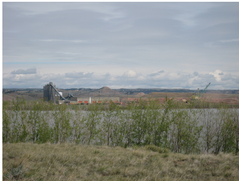
Decker Coal Mine

The once unthinkable has happened: a large coal strip mine in the Powder River Basin has permanently closed. The Decker Mine just north of the Wyoming border closed in January. The announcement didn't come with a flashy press release and corporate spin, but instead was disclosed through the myriad of lengthy legal filings in the Lighthouse Resources bankruptcy. Lighthouse, the company that owns and operates the Decker Mine, wrote, "mining at the Decker Mine has in fact ceased, and as of January 22, 2021, all but four union employees have been furloughed."